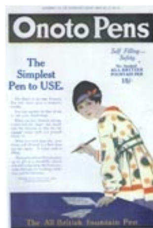
Onoto 'The Simplest Pen to Use' advertisement dated December 11, 1919 from The Illustrated London News.